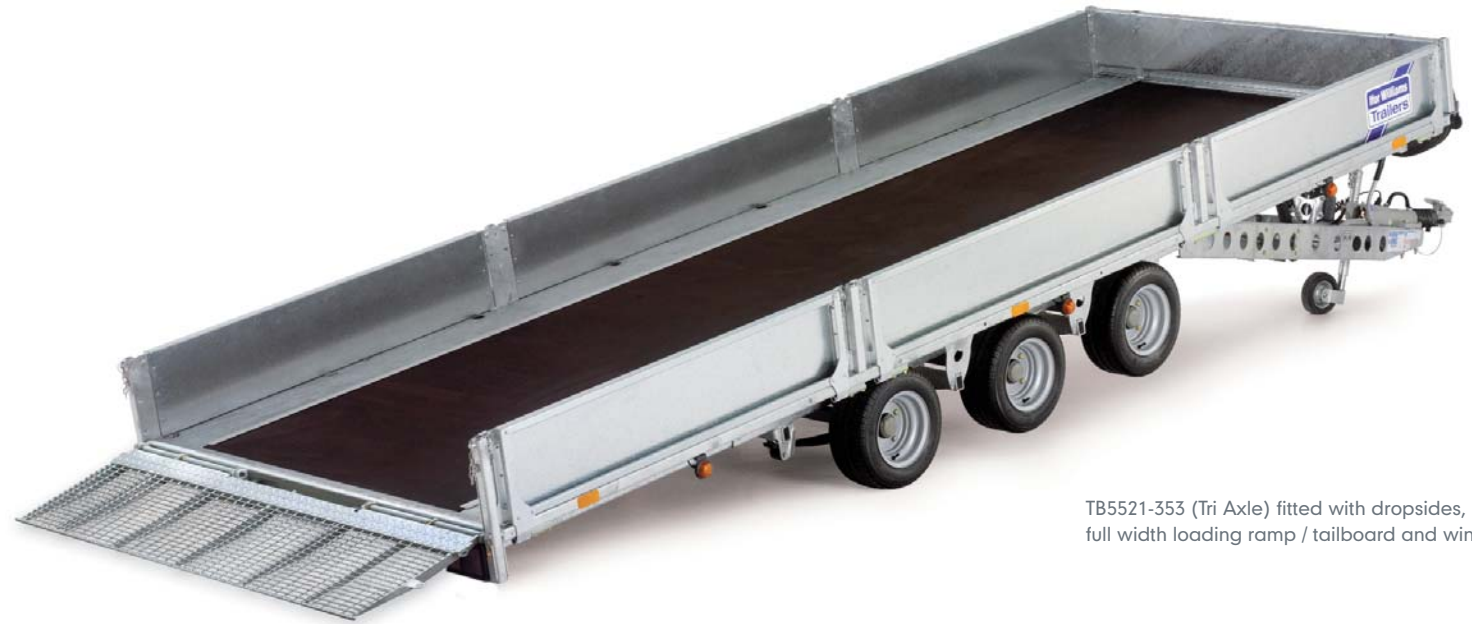
TB5521-353 (Tri Axle) fitted with dropsides, full width loading ramp / tailboard and winch.

2.3m wide versions of the TB range will be introduced in late 2010.