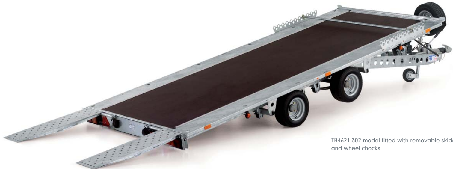
TB4621-302 model fitted with removable skids and wheel chocks.